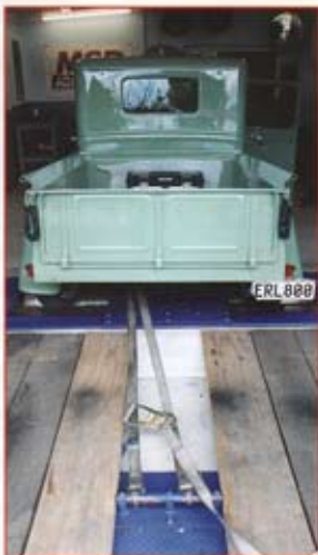
Tie-downs were installed front and rear to ensure the car stays in place on the high speed runs.