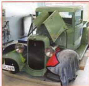
Next the hood was raised and soft covers installed to prevent scratching. The oil level was checked and we were on to the next stage.