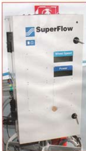
The SuperFlow Sensor box monitors and measures the data from the dyno and includes temperature measurement, pressure measurement, and air/fuel monitoring.

that's dear to the heart of every hot rodder worth his salt. The crew at WAER are both thorough and professional, even with a hot rod journo looking over their shoulder at every move. But what did we find? Our initial tune was 4 degrees retarded and our idle was too lean. This made the engine idle a bit erratic and sound over-cammed. Once we got dialled in the engine ran smoother and made more power. The air/fuel ratio was spot-on, great news considering the carb was bolted on and run as is out-of-the-box! The entire process took the best part of the day from whoa to go but we left smiling with new-found gains and peace of mind that we were totally tuned under our belt.