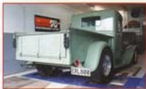
First step was to drive Proj '34 onto the dyno.